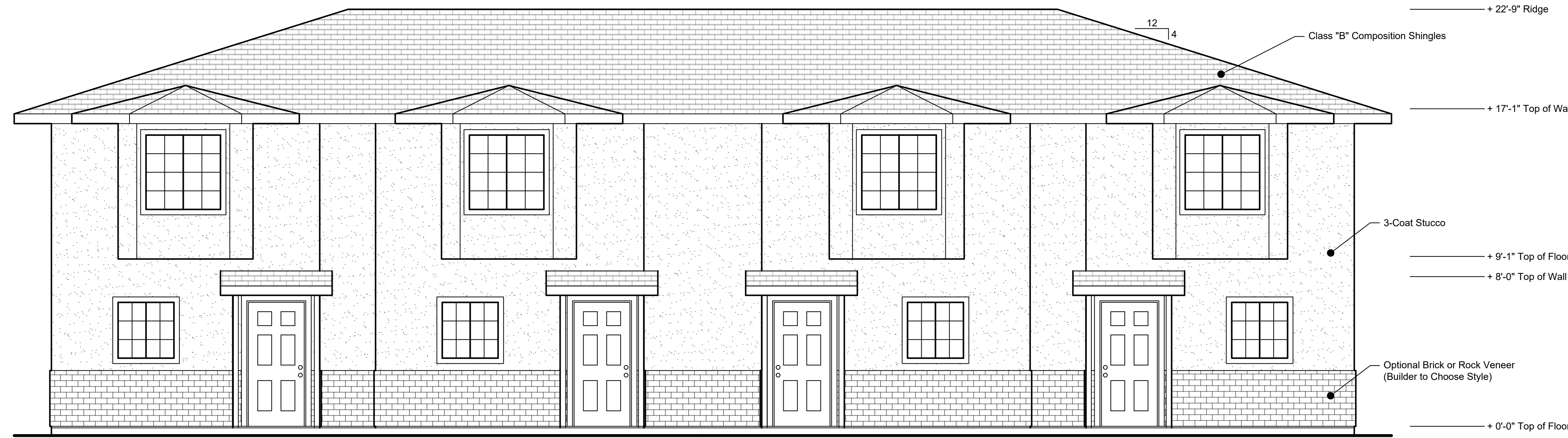
Front Elevation 1/4" = 1'