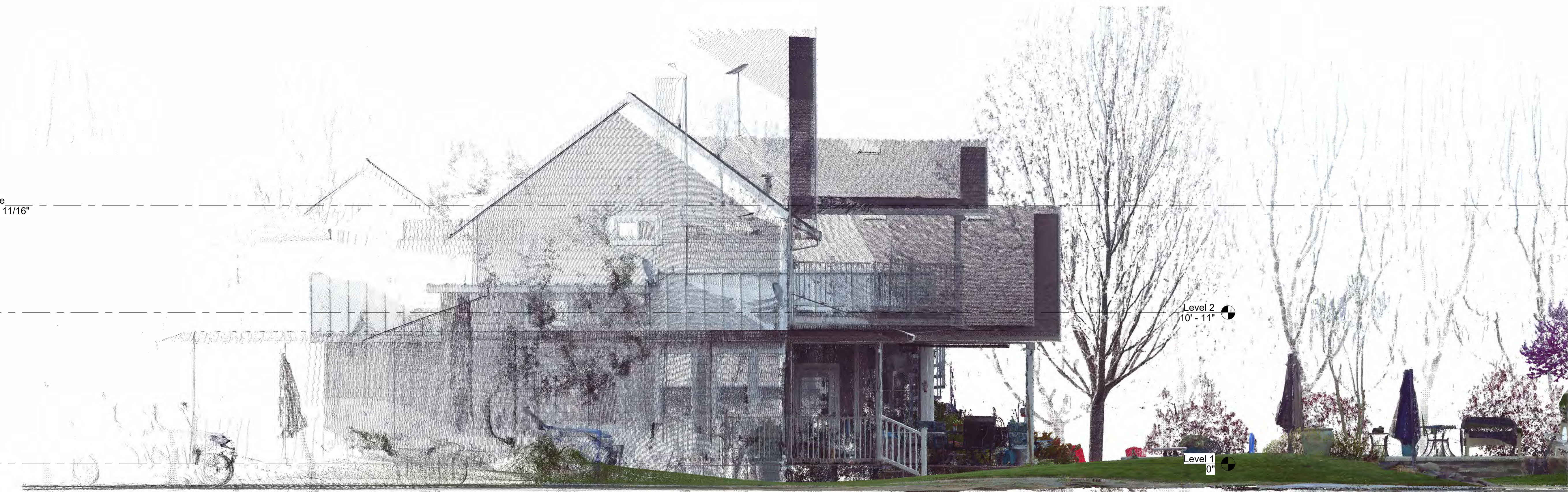
② West 1/4" = 1'-0"