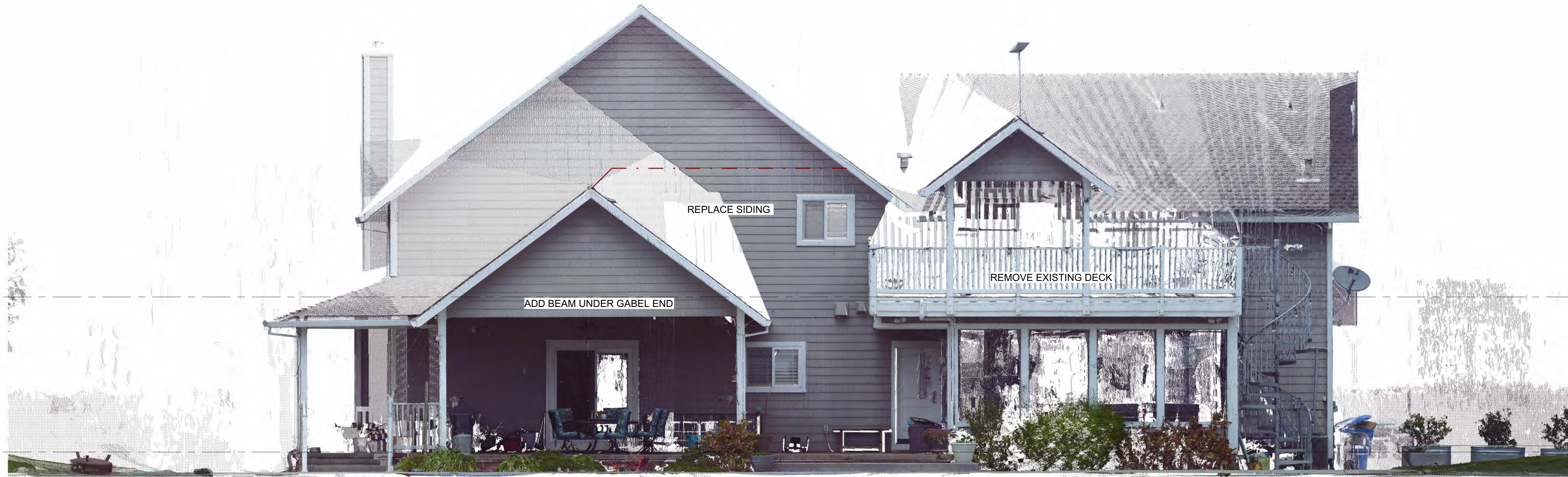
① South 1/4" = 1'-0"